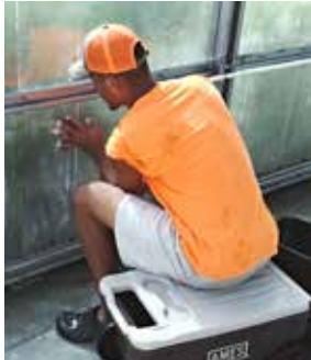
A member of the Second Chance program uses the tools the garden club received from a 2020 Ames Tool Grant on a project.