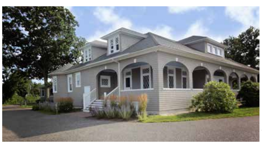
The historic ballroom at the John W. Masury estate.

In October 2012, the gardens and grounds of the estate were impacted significantly by Hurricane Sandy, which affected 24 states and most of the Fastern seaboard. In March 2013, members of the Moriches Garden Club took on the extraordinary task of refurbishing the flooded garden by