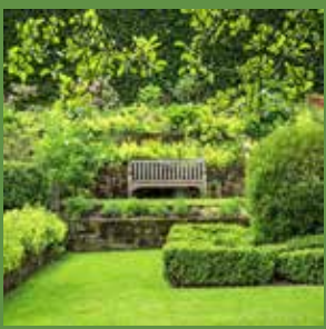
▲ Visitors to Woodward Park often navigate to the many green spaces offered at the popular destination.