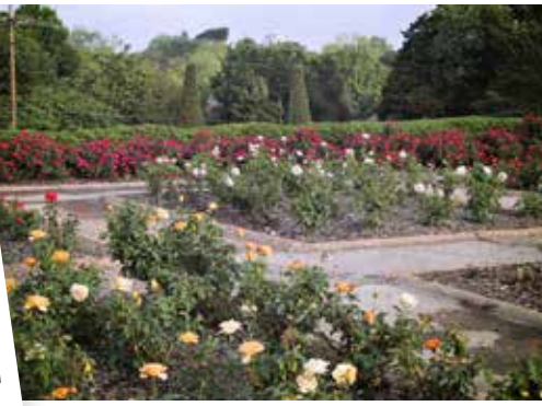
The original rose garden