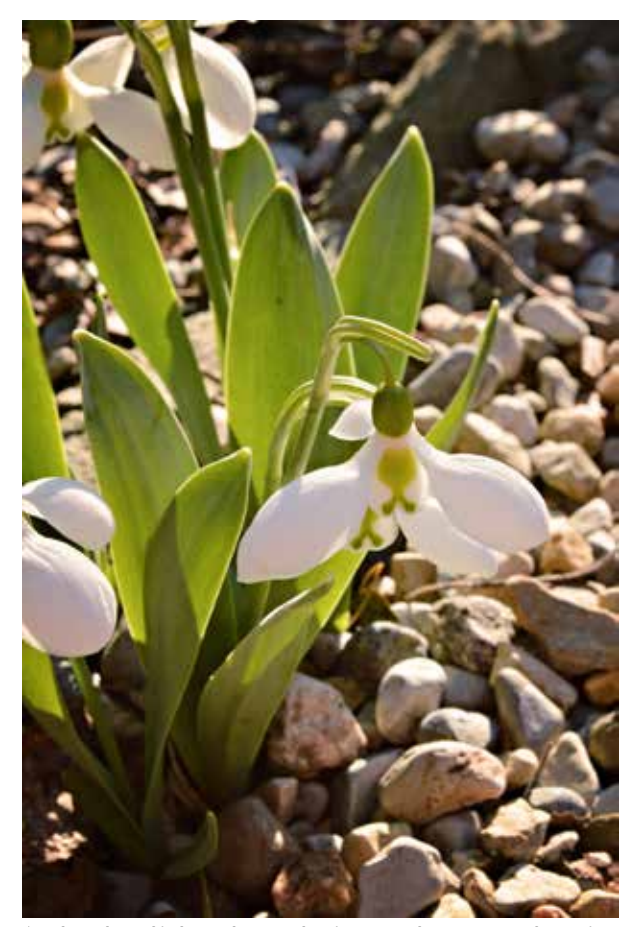
When planted in large clusters, the giant snowdrop creates a dramatic effect in landscapes, especially at the base of a tree.

developing young, discarding the seed once the elaiosome is devoured. In this manner, the seeds are distributed far and wide and the plants naturalize!