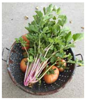
The easy-to-grow Chinese Pink Celery completes the nutritional rainbow.

to form, it branched into a sturdy clump of pink stems nearly a foot tall. When harvested and cooked in a stir-fry of veggies,