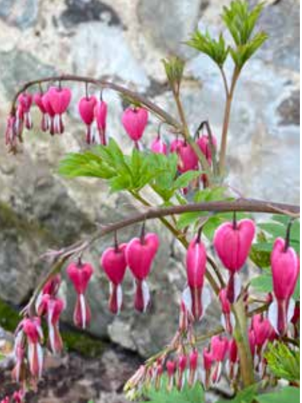
ABOVE AND TOP MIDDLE: A bleeding heart blooms in early May

66...the garden club has earned accolades for its many community beautification efforts on the local and state level...??