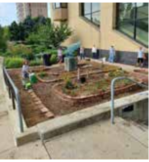
RIGHT: Future plans include the installation of a butterfly and pollinator garden on the grounds of the Grand Rapids Public Museum. An overgrown area (right), was cleared by Kent Garden Club members (above) and will be ready for a variety of pollinatorfriendly plantings in spring.

President Kent Garden Club Akw47@comcast.net