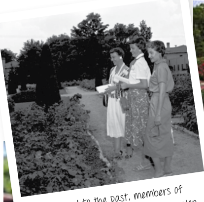
in a nod to the past, members of Tusa Garden club visit the rose garden.