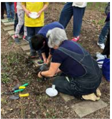
Children from a local preschool participate in a "dig and take" activity at the native garden. Students also learned about pollinators at the Monarch Watch Waystation garden.

Over the years, the garden club has earned accolades for its many community beautification efforts on the local and state level, and in 2019, received an NGC grant