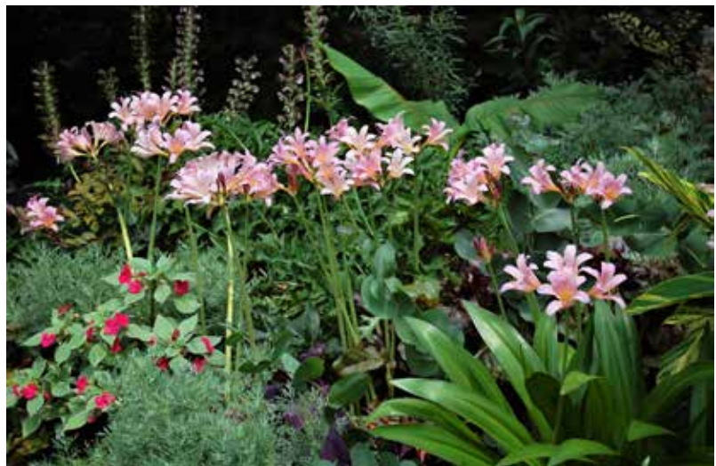
The sudden appearance of flowers on the surprise (or resurrection) lily after foliage has faded gives rise to the common names.

Of the major bulbs, most gardeners and landscapers have been exposed to the bevy of narcissus, tulips and flowering onion or Allium that are on the market. However, one plant that is widely available in catalogues, yet rarely appears in private or public plantings, is Lycoris squamigera, or the 'Surprise' or 'Resurrection' lily.